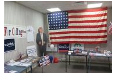
2016 Campaign Office

Election Day: Nov 8 Early Voting: Oct 29 -Nov 5