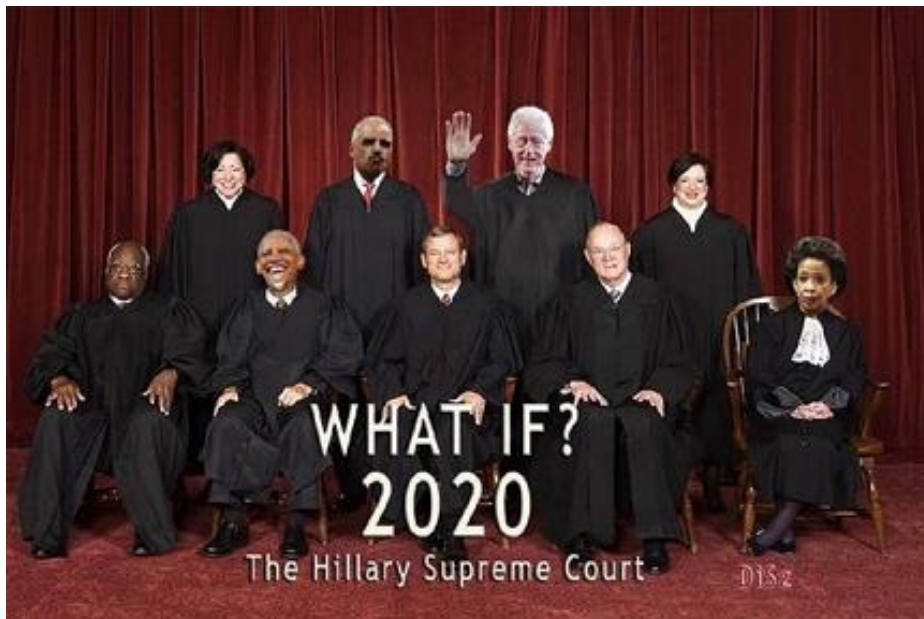
Look for Hillary's New Supreme Court Justices