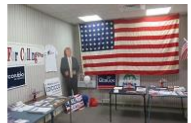
2016 Campaign Office

Election Day: Nov 8 Early Voting: Oct 29 -Nov 5