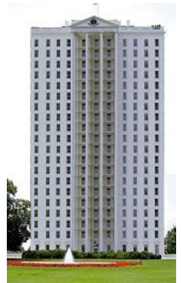
White House after Trump Moves In