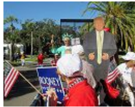
Sun Fiesta Parade and Early Voting Booth