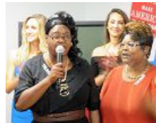
Lara Trump at Trump Headquarters in Sarasota with Women for Trump