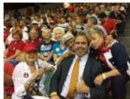
Trump Rally in Sarasota the Day Before the Election