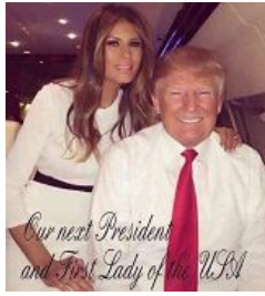
President-elect, Vice President-elect, and First Lady