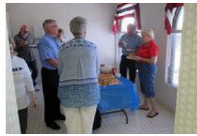
Venice Campaign Headquarters