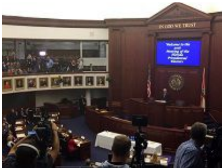
Florida Senate Chamber