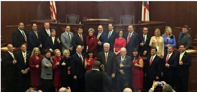
Our 29 Florida electors