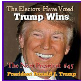
President-elect Donald J. Trump