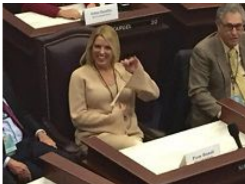
Florida Attorney General Pam Bondi