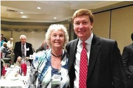
Reagan Day Patriot Dinner with Agriculture Commissioner Adam Putnam