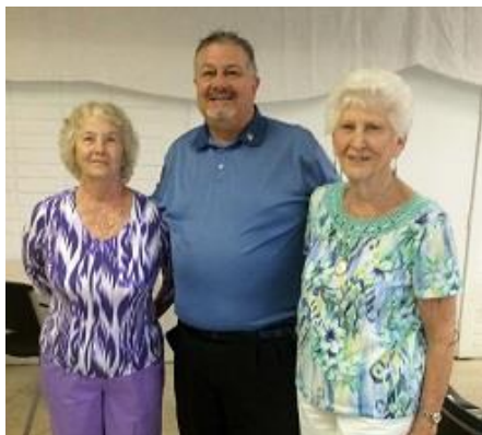
Members attending the May Republican executive committee meeting