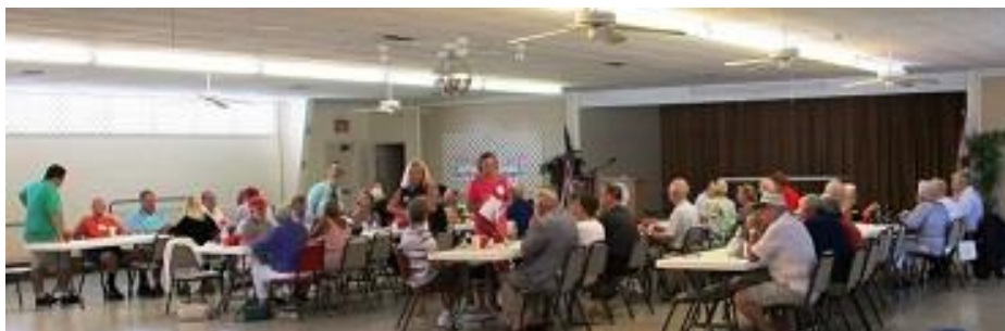
Members and guests enjoying lunch before the meeting.