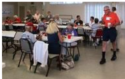
Members and guests at the hospitality table and selecting their tables before the meeting.