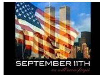
Never Forget – September 11, 2001

That book is Saul Alinsky's Rules for Radicals – a book so essential to the Liberals' war against America that it is and was the playbook for the entire Obama administration and the subject of Hillary Clinton's senior thesis. It is a book of such pure evil that Alinsky dedicated his book to Lucifer.