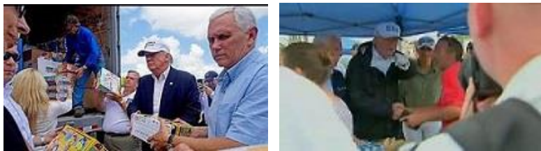
President, Vice President, and First Lady Distributing Supplies and Serving Food