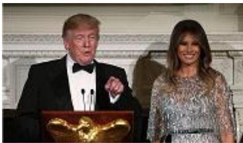
Attending State Dinner the Same Evening for the White House Historical Association