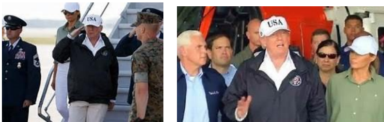
President Trump and First Lady Melania Trump Arrive in Ft Myers