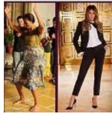
Michelle Obama’s designers refused to make clothes for Melania Trump.