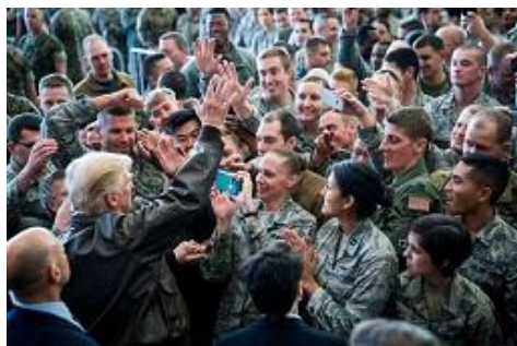
President Trump meeting with the troops in Japan