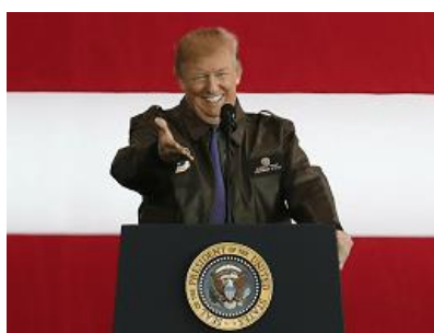
President Trump in Japan