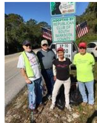
Road Crew, March 24, 2018

I'm just getting started, but you get the idea. ---Author . . . ?