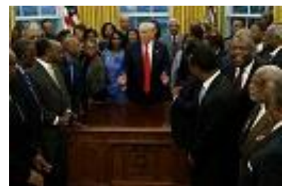
Blacks Doing Better Under Trump Administration