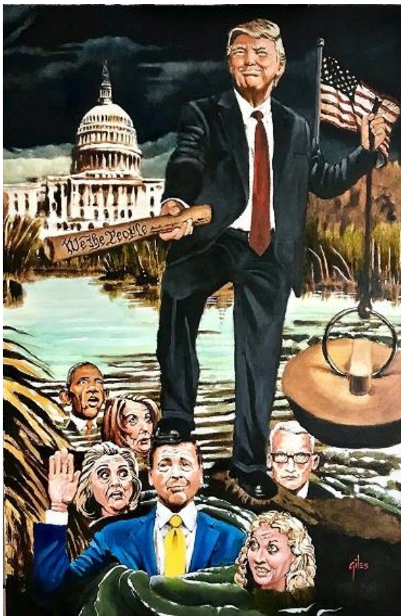
President Trump is Draining the Swamp