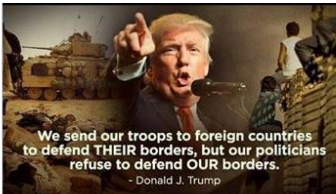
President Trump, the Wolverine

It's been 14 years since Rather's disgraceful exit from the top of a once-honorable profession, but his crack about Donald Trump on Monday shows he hasn't lost his ability to screw up when it comes to attacking a Republican president, and the "deplorables" are all too happy to let him know it. By now the mainstream media should have learned its lesson: Rolling out Dan Rather is never a good idea.