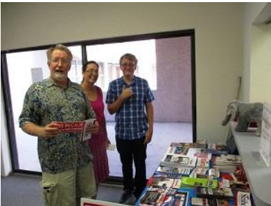
Open House for Venice Campaign Office, August 4, 2018