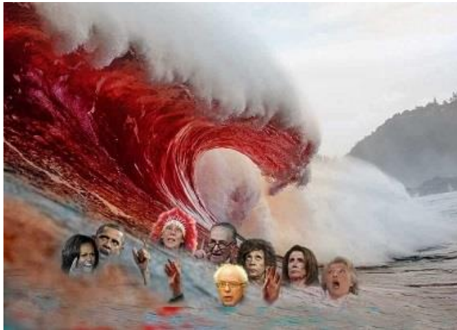
The Red Tide