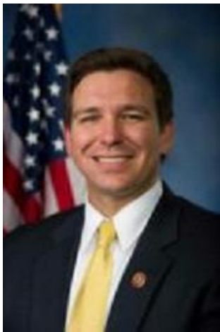
Governor-elect Ron DeSantis