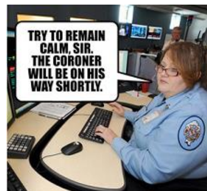
Response from 911