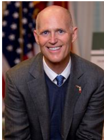
Senator-elect Rick Scott