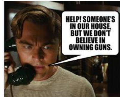
Call to 911