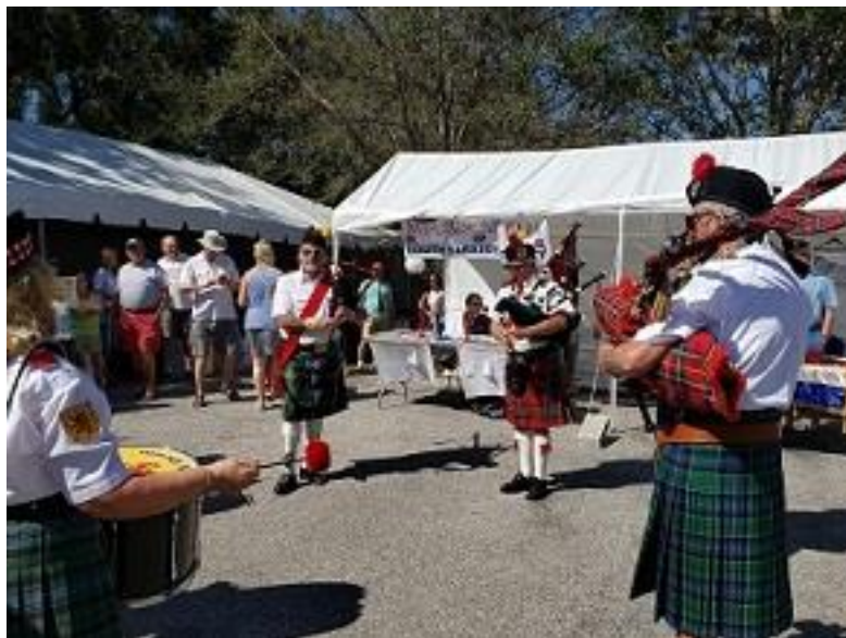
RCSSC Booth at the Jewish Food Festival, February 18

Finally, a Commercial. For current members, please stop by the table to pay your dues for 2019! The dues keep the Club going. For the rest, please come to the March meeting and join the Club. We are the most active Republican club in the county!