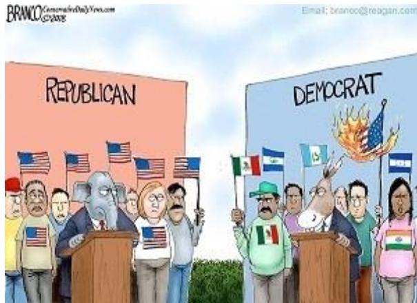
Progressives Bearing Gifts , by Victor Davis Hanson, American Greatness , February 10th, 2019, Excerpts.

Unfortunately, it seems like the trend of American socialism is picking up steam. These presidential candidates (along with many voters) are determined to turn America into yet another failed experiment in socialism.