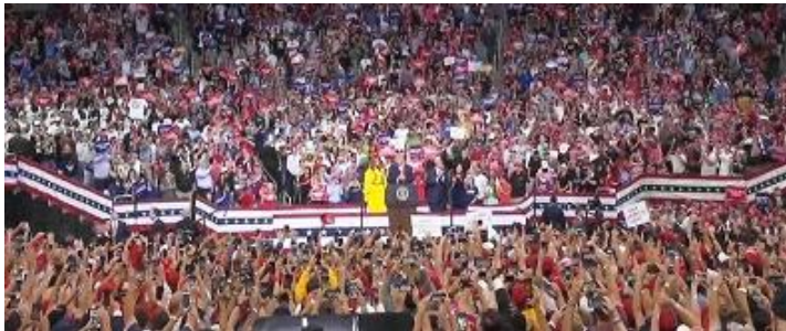
President Trump and Melania greeted the amazing record crowd of supporters at his reelection rally in Orlando, Florida

Trump becomes the Democrats' great white whale, by Victor Davis Hanson, Washington Times , May 30, 2019, Excerpts.