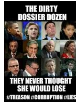
This is the Best Graphic description of the Utter Stupidity of the Left :