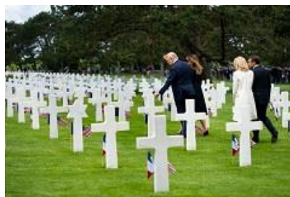
President Trump honored the heroes of D-Day and toured the gravesite at Normandy