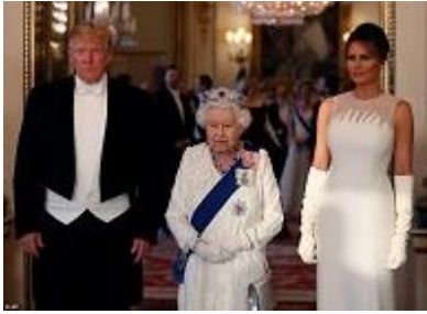
U.S. President Donald Trump sat with Queen Elizabeth at the State Banquet at Buckingham Palace in London as he was granted the highest honor possible for the monarch to give a visiting world leader