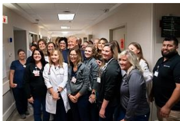
'You Had God Watching': Trump Seeks to Console Shooting Survivors, The Daily Signal, July 7, 2019