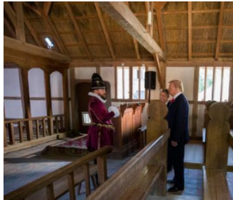
The Mace of the Virginia House of Delegates is seen as President Trump delivers his remarks after touring the old Jamestown settlement