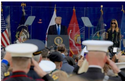
President Donald Trump arrives to salutes from Marines at the 100th year anniversary of the Veterans Day Parade.