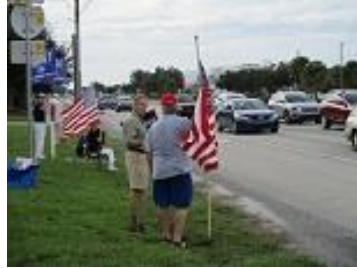
RCSSC Flag-waving for President Trump, Nov 8.

Next RCSSC flag-waving will be held on Dec 13 at Jacaranda and #41; 3:00-5:00.