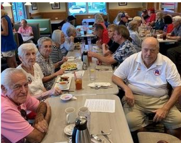
October Meet and Eat Luncheon at Perkins Restaurant

Trump no longer needs to win recounts, and he certainly doesn't need the media on his side. They won't be around much longer anyway. All Trump needs is to continue gathering evidence, prepare to present it to the world, and continue to garner support from millions of Americans who are ready to lay their lives on the line, if necessary, to defend this nation.